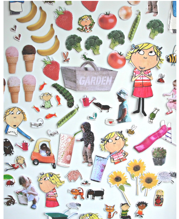
This example upcycled a magazine and family photos