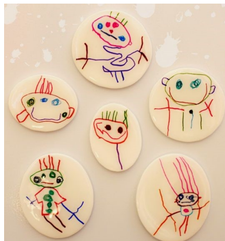
Drawn family magnets